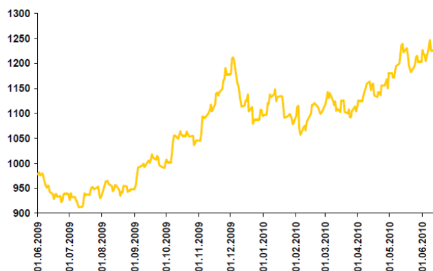
Gold price development since the last Gold Report

Sources: Datastream, Erste Group Research